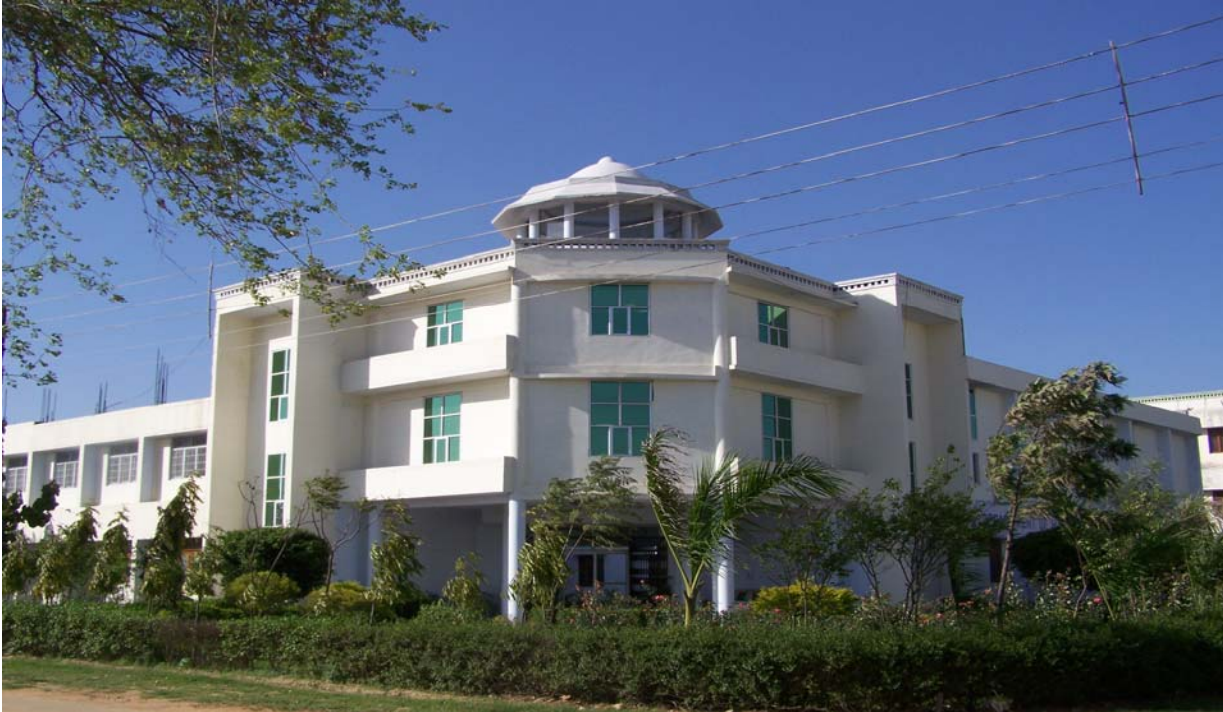
Department of Management Studies

This Department was established in the year 1998 and had been offering the Master of Business Administration (MBA) programme of Rohilkhand University, Bareilly, until 2000 when the Department came under the purview and affiliation of the Uttar Pradesh Technical University, Lucknow. It has now become one of the most reputed centres of education in the field of management studies. The Department has a well-developed infrastructure including a modern computer laboratory, networked to a central server and Internet facility at 2 Mbps. The Department has established an effective industry-institution interaction and executes projects of practical relevance. It organizes workshops and seminars on a regular basis.